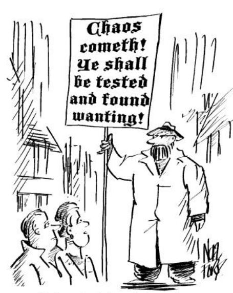
Perhaps he's heard that we're losing our churchwarden

God knows how stressful life is; He wants to ease our cares, And He'll respond to all your needs A.S.A.P. - ALWAYS SAY A PRAYER.