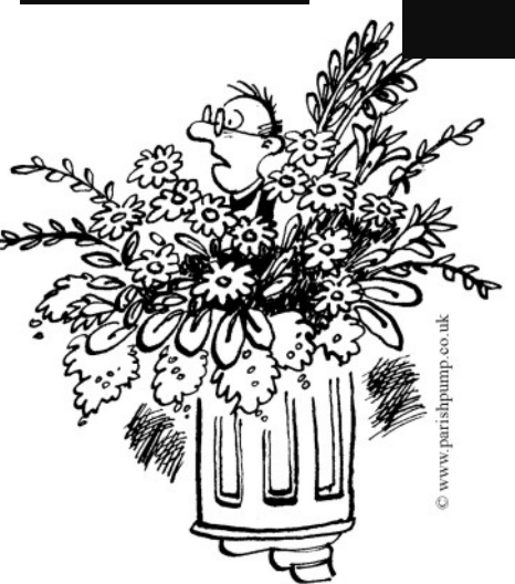
...I wonder if I could have a quick word with the flower arrangers at the end of this service...?