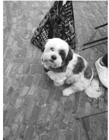
It's supposed to be bring and share

Thus the meal comprised of sampling different foods, listening to music, exercising dogs, buying plants, comparing gardening experiences and catching up on each others news. As the old saying goes, A' good time was had by all'.